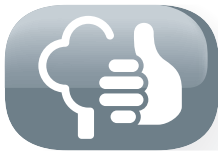
Environmental friendly (carbon neutral)